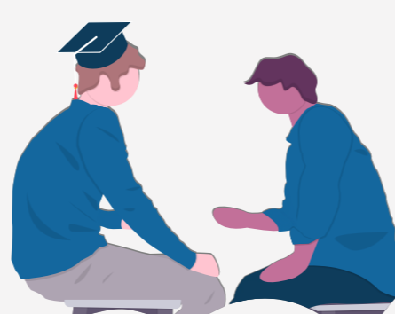
2. PRIVATE OWNER