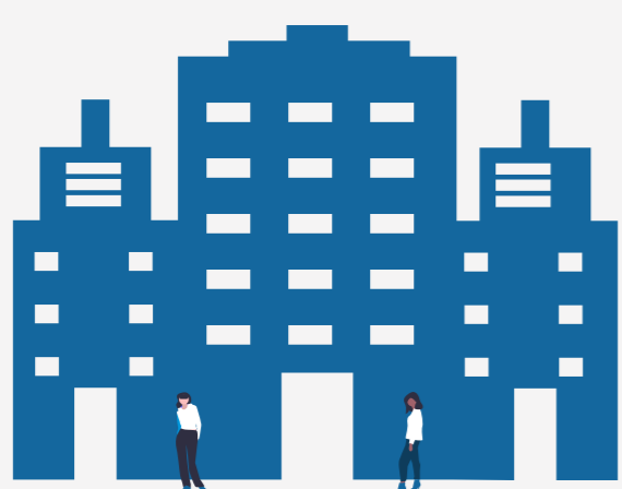
1. STUDENT RESIDENCE (CROUS / PRIVATE RESIDENCE...)