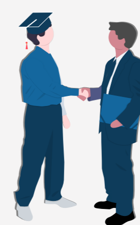
3. REAL ESTATE AGENCY